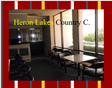
Heron Lakes Country C.

The final meeting of the Tis-the-Season Task Group was held Wednesday, November 18th. The invitations (180 of them) have all gone out and now the waiting for responses is underway. Last minute checks with Heron Lakes Country Club have been completed and excitement is rising. The very special annual fundraiser is a much anticipated kickoff to the busy holiday season. Click here to go to our website and click on "Short Info Videos" to see a video of last years event. If you did not receive an invitation and would like to attend, click on the wreath.