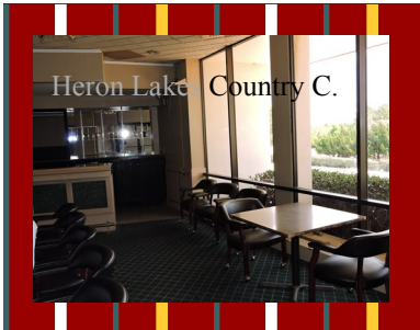
Heron Lakes Country C.

The final meeting of the Tis-the-Season Task Group was held Wednesday, November 18th. The invitations (180 of them) have all gone out and now the waiting for responses is underway. Last minute checks with Heron Lakes Country Club have been completed and excitement is rising. The very special annual fundraiser is a much anticipated kickoff to the busy holiday season. Click here to go to our website and click on "Short Info Videos" to see a video of last years event. If you did not receive an invitation and would like to attend, click on the wreath.